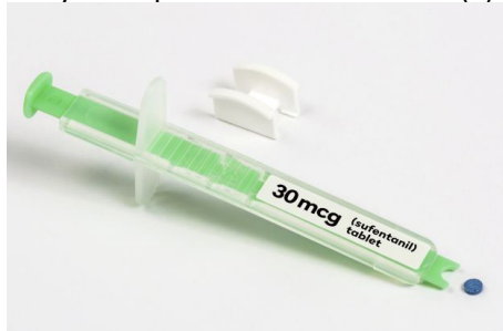
Figure 1: Sublingual Sufentanil (DSUVIA) Applicator

The Food and Drug Administration (FDA) garnered praise and criticism when it approved a sublingual form of sufentanil (DSUVIA) in November of 2018. Those in favor cited a need for alternatives to intravenous (IV) pain medications for use when access to IV sites are limited (i.e., burn patients, elderly, obese). While others raised concerns about the potential for abuse and diversion in the midst of an opioid epidemic. DSUVIA is a sublingual form of sufentanil that is produced by AcelRx Pharmaceuticals. The approved formulation includes a single 30 mcg/mL tablet that is dispensed from a single-dose applicator (1). According to the manufacturer, each applicator is packaged in its own sealed, tamper-evident pouch and will only be available in medical settings. No retail pharmacies will carry or dispense this formulation (2).