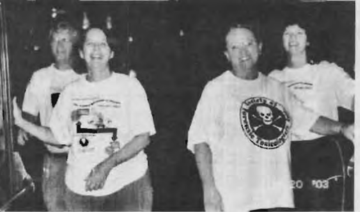
2004 Fun Run application included in this issue